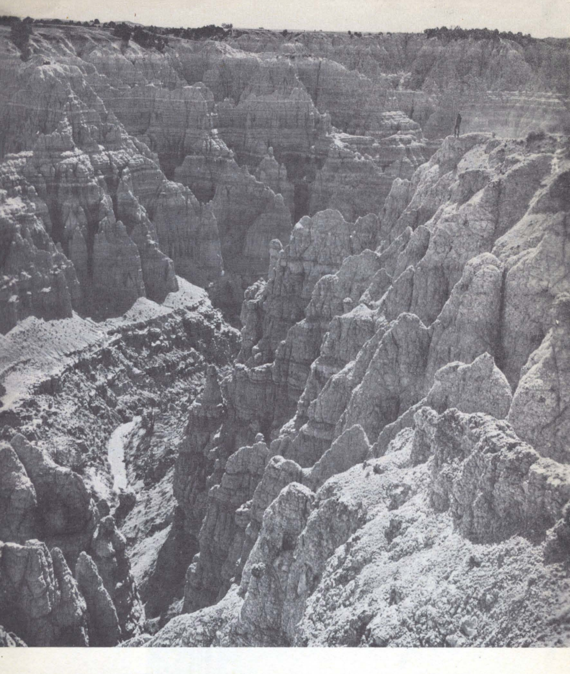
Badlands NATIONAL MONUMENT · South Dakota