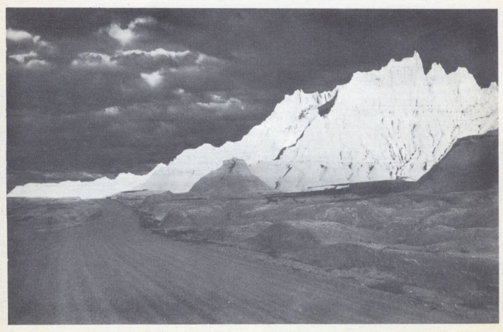
Sunlight Through a Rift in Storm Clouds Makes a Vivid Badlands Scene

Devils Tower is a remnant of an ancient volcanic plug, rising 600 feet above the surrounding country, testifying to the violent forces which once were at work in the Black Hills region. It is located in eastern Wyoming, 70 miles west of Spearfish, S. Dak., on Highway 14, and may be reached through. Newcastle and Moorcroft, Wyo., on Highway 16. A museum at the base of the tower contains interesting exhibits, and Park Service employees are available for lectures and information.