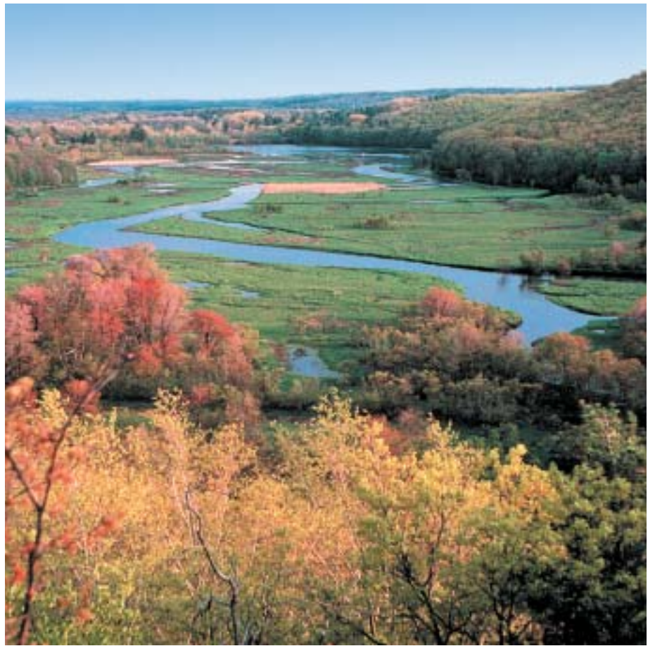
photo of view from Lookout Rock

Flat water paddling is characterized as water with very little current and no major obstacles. Paddling on the many mill ponds created by the dams along the river and in the Blackstone Canal are good examples of flat water paddling. Quick water is characterized as either Class I or Class II based on the International Scale of River Difficulty. A Class I river has a current with a few riffles and small waves and paddlers run into few or no obstructions. A Class II river will have easy rapids with waves up to 3 feet high and wide clear channels. Some skills to safely maneuver your boat are required. Tours in the Water Trails Guide will be on portions of the river classified as either Class I or Class II. However, significant maneuvering is required through the flood plain of the Blackstone due to numerous horseshoe bends and S-curves that are prevalent throughout most of the Massachusetts section of the river. The river begins to get broader and flatter beginning in the South Uxbridge section of the river and through Rhode Island. This is a diverse yet intimate river full of surprises for paddlers. Enjoy your trip as you discover why the Blackstone River was once called "America's Hardest Working River"!