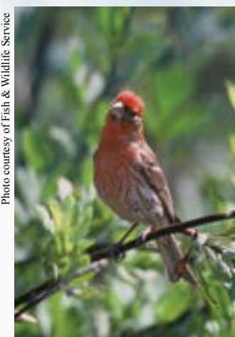
The House Finch is commonly seen at the monument – the male has a bright red chest while the female is brown with bold streaks.

A portion of the 5-mile access road to the monument crosses Pueblo de Cochiti tribal land. Neighbors in the vicinity include the Santo Domingo and Jemez Pueblos, private landowners, the Santa Fe National Forest and State of New Mexico. Please respect these landowners and their property. Restrictions are posted.