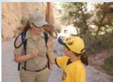
The monument serves as an outdoor laboratory for students of all ages.

Precariously perched on many of the tapering hoodoos are boulder caps that protect the softer pumice and tuff below. Some tents have lost their hard, resistant caprocks and