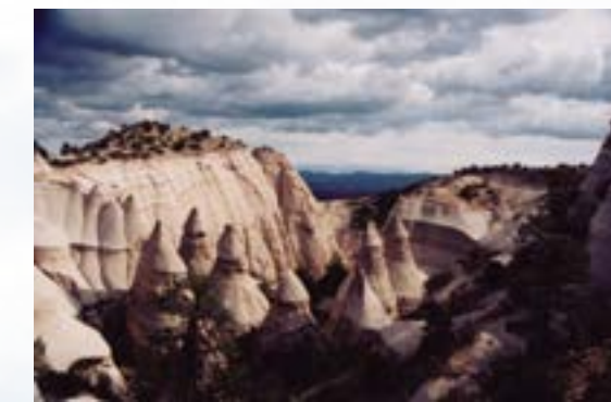
A beautiful view from atop the Canyon Trail.

Kasha-Katuwe Tent Rocks National Monument