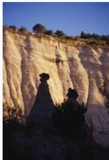
The boulder "cap" protects the fragile tent-shaped formation beneath it.

The Bureau of Land Management (BLM) manages Kasha-Katuwe Tent Rocks National Monument (KKTR) to protect its geologic, scenic and cultural values. The agency works in close coordination and cooperation with the Pueblo de Cochiti; and enjoys a partnership with the University of New Mexico, and Sandoval County to provide access, facility development and maintenance, resource protection, research opportunities, public education and enjoyment.