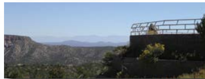
From the Veterans' Memorial Scenic Overlook, you can see spectacular vistas of Camada and Peralta Canyons, the Dome Wilderness, and Jemez Mountains.