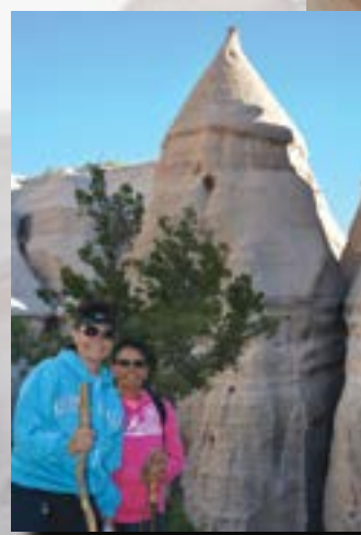
Recreationalists enjoy the unique rock formations along the Slot Canyon Trail.