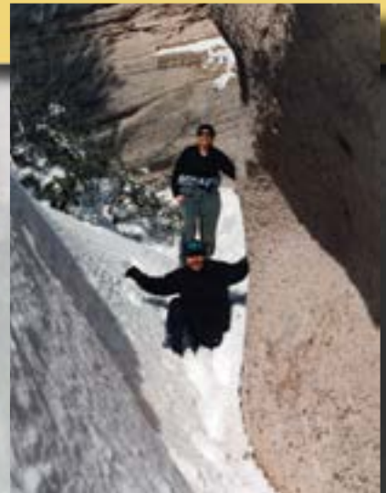
Hikers enjoy all seasons at the monument.