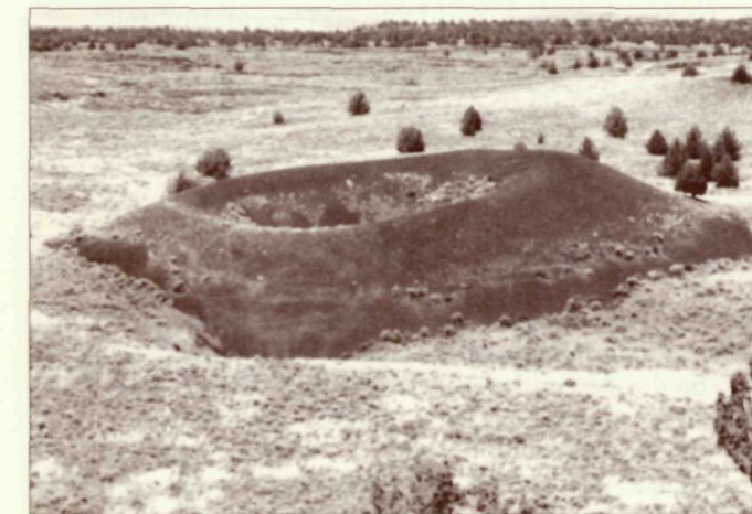
Little Red Cone, Diamond Craters

Check the map in this brochure or at the byway interpretive shelters to determine your location. Then choose the route that will take you to the features you want to explore and some you didn't even know existed.