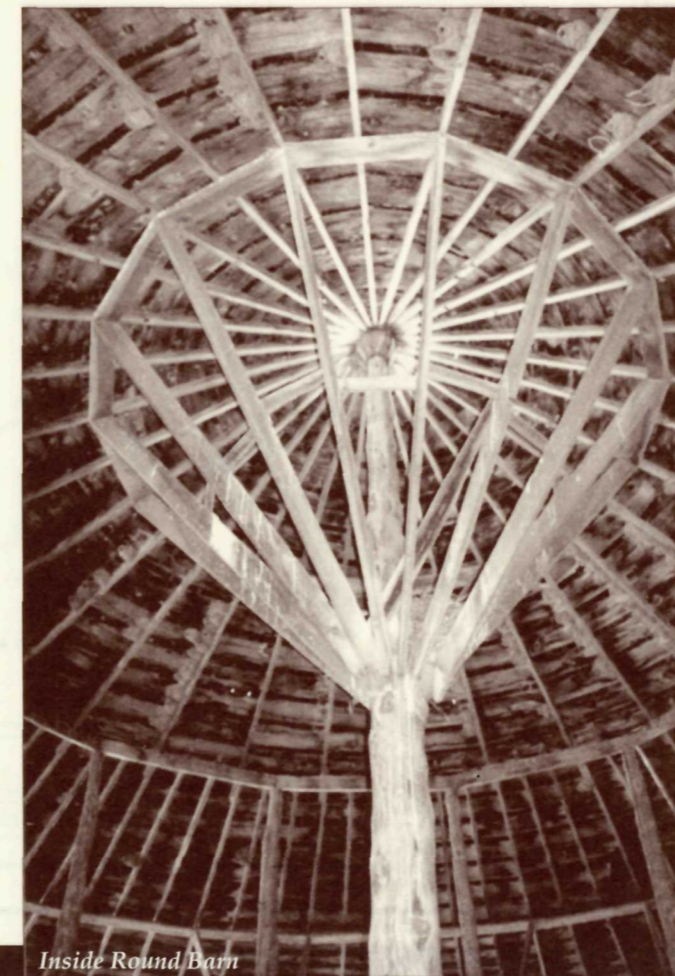
Inside Round Barn

Whether you are exploring a lava flow, stopping at small historic towns, or passing the ranches scattered throughout the valleys between the Steens and Riddle mountains, you will travel back country roads that lead to attractions right out of the "Old West."