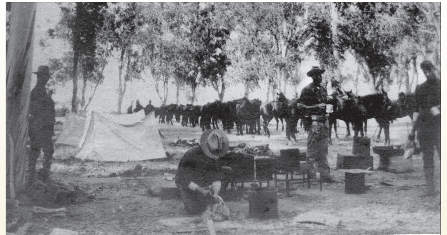
Cavalry encampment, likely en route to Sequoia National Park, 1903.