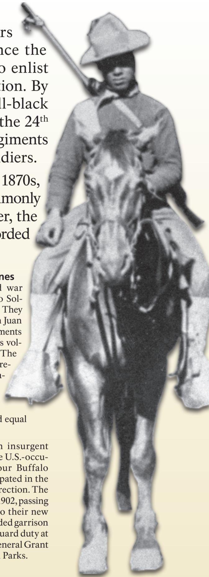
Member of the 24 th Infantry on mounted patrol in Yosemite, 1899.

After Spain's defeat, an insurgent movement emerged in the U.S.-occupied Philippines. All four Buffalo Soldier regiments participated in the ensuing Philippine Insurrection. The troops began to return in 1902, passing through San Francisco to their new assignments, which included garrison duty at the Presidio and guard duty at Yosemite, Sequoia and General Grant (Kings Canyon) National Parks.