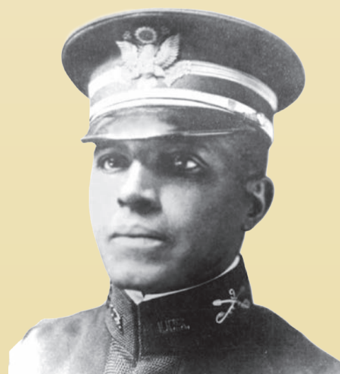
Portrait of Charles Young.

Although troops of the 9 th Cavalry went to Sequoia and General Grant for the following summer, Young never returned to the parks. He would reflect on that summer as a time from which he emerged "a different man with a better outlook." In honor of Young and the Buffalo Soldiers, the Colonel Charles Young Tree was dedicated in 2004.