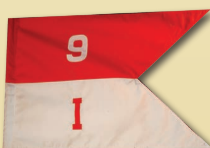
9 th Cavalry Guidon.

Presidio of San Francisco 223 Halleck Street Presidio of San Francisco, CA 94129 www.nps.gov/prsf Yosemite National Park P.O. Box 577 Yosemite, CA 95389-0577 www.nps.gov/yo Sequoia/Kings Canyon National Park 47050 Generals Highway Three Rivers, CA 93271-9700 www.nps.gov/seki