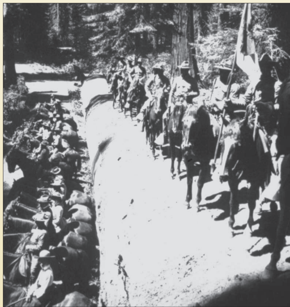
Members of Troops C and D, 9 th Cavalry on the Fallen Monarch, 1904.

The sublime beauty of Yosemite's waterfalls, cliffs, meadows, and groves makes the park one of the most scenic places in the world. After Yosemite National Park was created on October 1, 1890, the Army administered the park from headquarters in Camp A. E. Wood in Wawona.