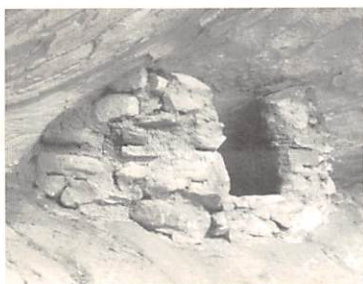
Granary built by the ancestral Puebloans