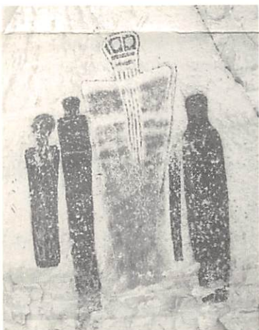
Detail from the Great Gallery rock art panel in Horseshoe Canyon

Humans first visited Canyonlands over 10,000 years ago. Nomadic groups of hunter-gatherers roamed throughout the southwest from 8,000 B.C. to 500 B.C. Living off the land, these people depended on the availability of wild plants and animals for their survival. They do not appear to have stayed in any one area for very long. They left little in the way of artifacts and didn't build homes or other lasting structures. However, the hunter-gatherers during this time created a great deal of intriguing rock art. Some of the best examples of their art, known as "Barrier Canyon Style," remain on the cliff walls of Horseshoe Canyon.