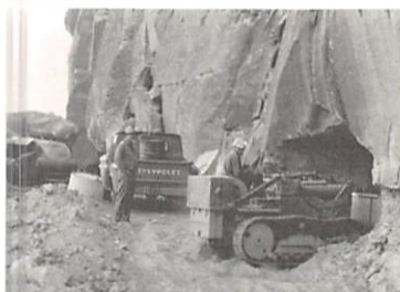
Working a uranium claim at the Island in the Sky four months after the park was established in 1964.