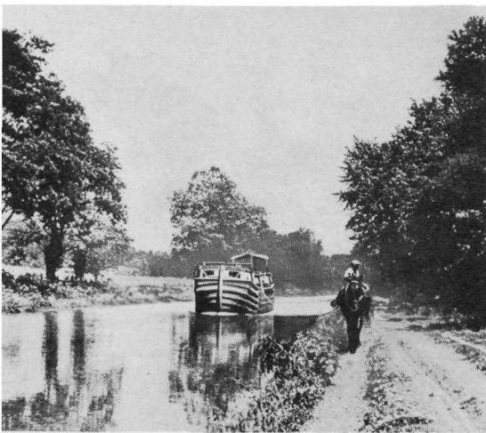
Typical canal boating scene of several decades ago.

measures about 60 feet wide and 6 feet deep. The towpath is generally 12 feet wide.