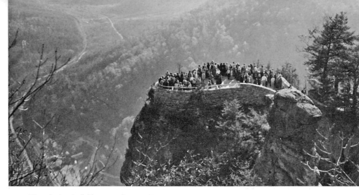
Pinnacle Overlook Terrace.

For some years, most of this great stream continued to pass through Cumberland Gap. and in 1796 the Wilderness Road was wid ened and improved for wagon traffic. The final defeat of the northern Indians and the opening of more direct routes across the mountains, however, eventually diverted most of the travelers. By 1825, a large part