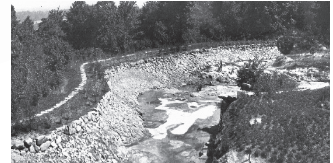
Construction of the Lagoon, c. 1914.

The stone taken from here was ground up to make glass. I filled the depressions with water, planted foliage and grass.