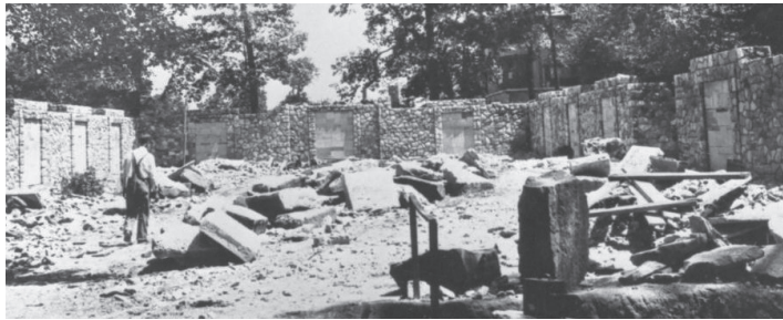
Construction of the English Garden, 1914.

Step inside this walled "secret garden." A water goddess waits within. Explore awhile and relax on a bench, before exiting where you came in.