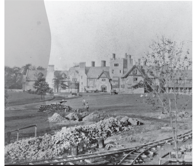
Construction of Stan Hywet, c. 1915.