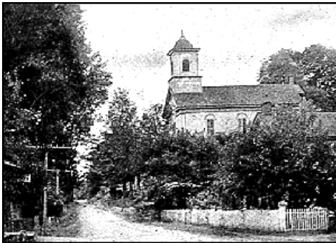
Lower Main Street around 1910

Dingman then established a ferry to enable himself and other settlers to bring across supplies, cattle, and crops. So from 1735 up to this day, there always has been either a ferry or a bridge at this location. In 1868, when a ferry was operating, the town name changed to Dingmans Ferry .