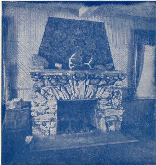
● See the petrified rock fireplace at the lodge. Visit the free museum of fossils.

REGULATIONS—"It is unlawful to injure, destroy, or appropriate specimens of petrified wood of any size whatsoever, found within the boundary, or to deface, injure, disturb, or mark any ruins, relics, pictures, or other works of primitive or prehistoric man, or natural formations . . . and violators will be prosecuted to the full extent of the law."