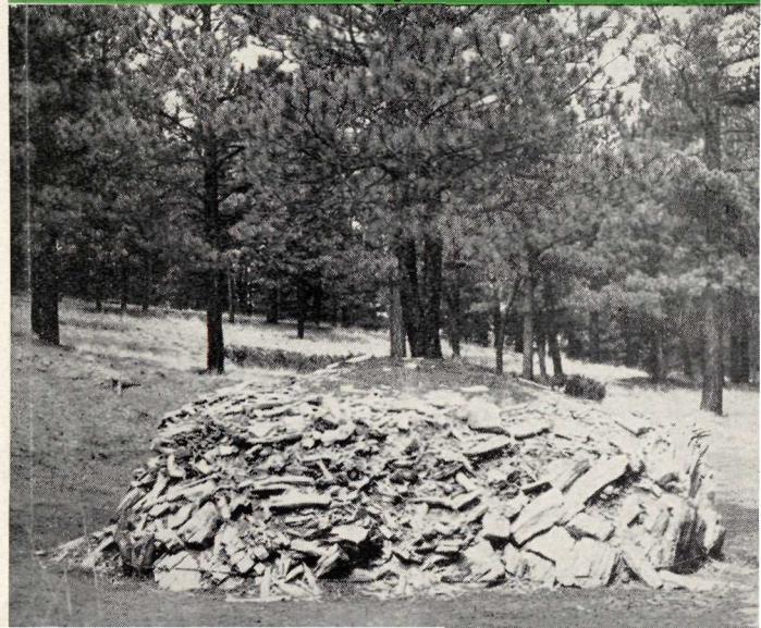
Below — Trunk 15 Feet in Diameter with a Pine Tree Growing on the Top