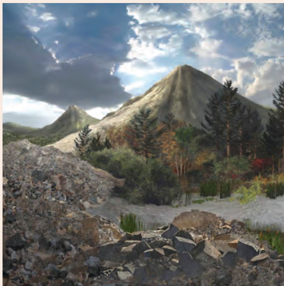
Artistic reconstruction of a lahar as it dammed the stream. Note the mixed size of debris throughout the volcanic mudflow.

On both sides of the roadcut you can see the lahar that originated from the Guffey volcanic center to the west. This lahar dammed the stream that flowed through the ancient Florissant valley, thus forming Lake Florissant. The lake was about 1 mile (1–2 km) wide and extended 12 miles (19 km) northwards. The debris carried by the flow contained rock fragments of different compositions, shapes, and sizes (sand grains to boulders), which is typical for lahars. The dark fragments are pieces of Thirtynine Mile andesite (a dark, fine-grained volcanic rock). The lighter, pinkish fragments are pieces of 1.4-billion-year-old Cripple Creek Granite. Notice that some rocks are rounded, indicating that they were picked up from the streambed by the lahar. In the roadcut on the east side, you can see a light-colored clastic dike of sediment that squeezed up from the streambed as the lahar settled.