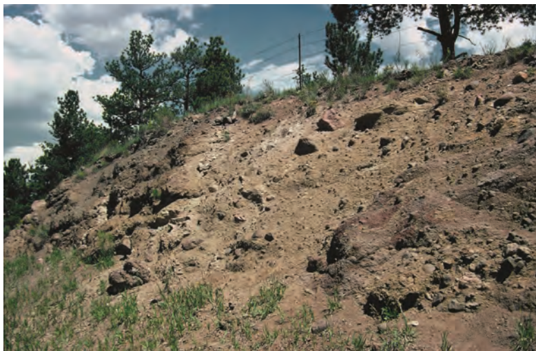
The rock breccia that formed from a lahar is exposed at stop 1.

The lahars that flowed from the Guffey volcanic center once filled this valley to a level far above the point on which you are standing. The valley of modern West Four Mile Creek below you formed as erosion cut through the lahars and exhumed the surface of the ancient valley. As it did so, the creek became entrenched, or trapped, in its path and was not able to change direction when it encountered the much harder Cripple Creek Granite beneath it. This is how the canyon to your right (north) was formed.