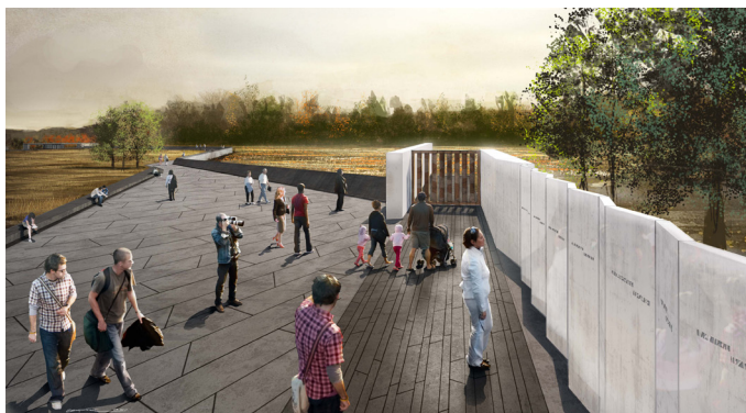
Artist's rendering of the Memorial Plaza at the crash site and Wall of Names, dedicated September 10, 2011.