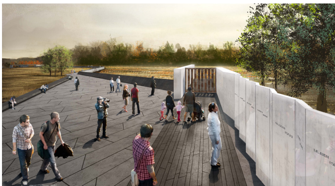
Artist's rendering of the Memorial Plaza at the crash site and Wall of Names, dedicated September 10, 2011.