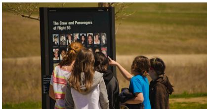
Young visitors explore the story of Flight 93.

Outdoor exhibits, a cell phone tour, Park Rangers, and volunteers provide more information to visitors.