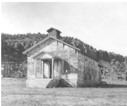
The Chapel at Fort Davis, built in the late 1870s, served as the post school for both the enlisted men and children of the garrison.

Following the Civil War, Congress passed legislation to increase the size of the U. S. Army. The Act of July 28, 1866 stipulated that of the new regiments created, two cavalry and four infantry "shall be composed of colored men." The Act also provided that an army chaplain be assigned to each of the newly- created African-American regiments.