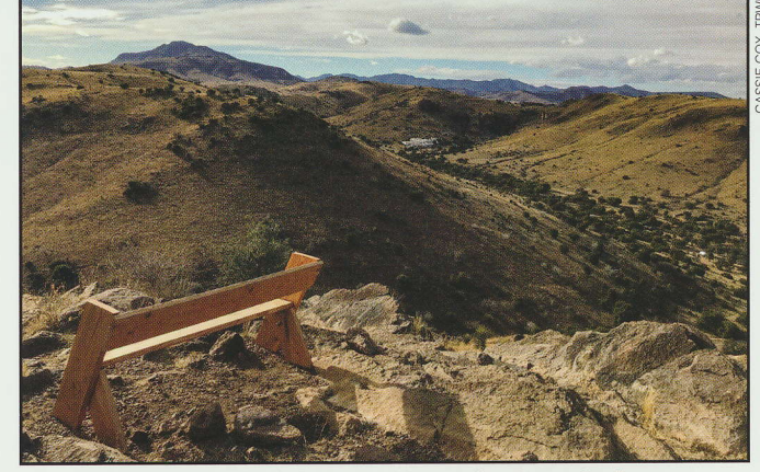
Keesey Canyon Overlook in Davis Mountains State Park

1935 CCC Camp set up while building the state park and lodge