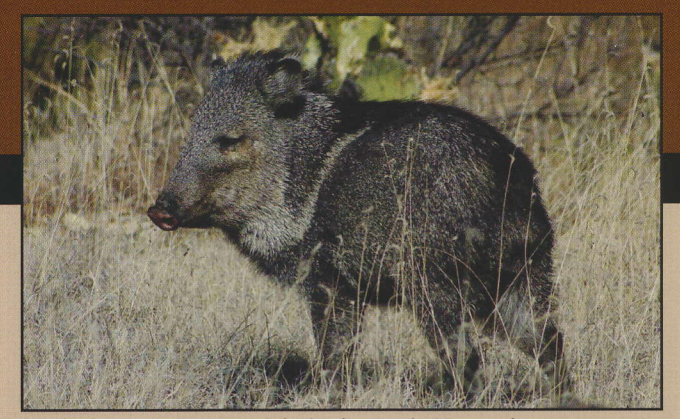
Javelina are a common sight in the Davis Mountains.

Davis Mountains State Park is a globally important birdwatching area and premier stargazing location. You can also enjoy hiking, mountain biking and day-use horseback-riding trails, camping and park ranger-led programs. McDonald Observatory and Fort Davis National Historic Site are nearby. We encourage you to tread lightly and help protect this unique and sensitive environment.