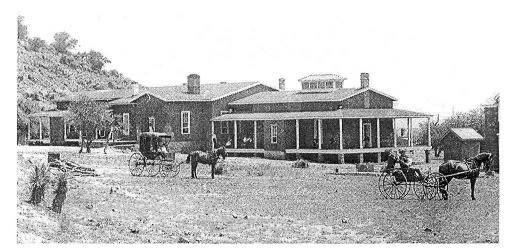
Late 1880s view showing back of post hospital