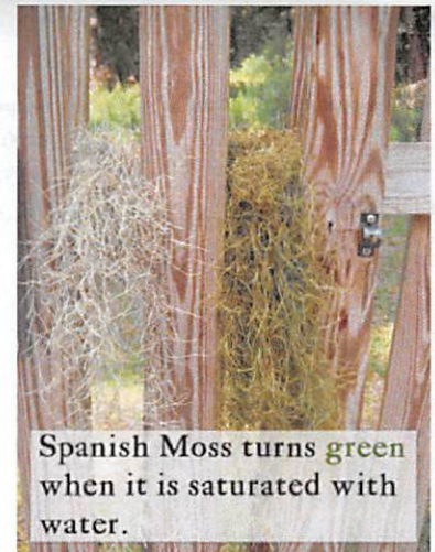
Spanish Moss turns green when it is saturated with water.

Spanish Moss is capable of holding up to 10 times its weight in water. By holding moisture the moss actually creates a cooler environment in the canopy and reduces water content in the soil around the tree.