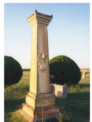
Fort Wallace Monument

The soldiers at Fort Larned were not the only ones to erect such a monument at a frontier Army post. In 1867 soldiers at Fort Wallace, Kansas, dedicated a monument in honor of soldiers there who had died in the Indian Wars.