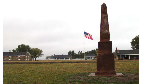
Modern View of Fort Larned Cemetery

“To the east of the post there is a dry ravine nearly circular in form surrounding a level piece of ground...lying in contact with the creek at one side; on this island...[is]the old burying ground...”