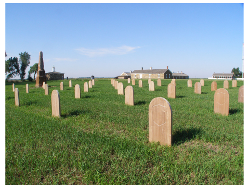
The Commemorative Grave Markers

In 1886, members of the Grand Army of the Republic, a Union veterans organization, moved the soldiers' monument to the Larned Town Cemetery located four miles to the east. In 2009, as part of the fort's 150th anniversary celebration, the monument was restored and returned to its original location at the Fort Larned Post Cemetery. Wooden headstones and a bronze marker were also placed in the cemetery to commemorate the soldiers originally buried there.