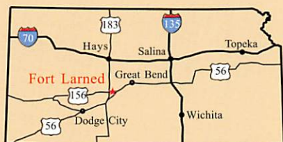
Fort Larned NHS is 29 miles west of Great Bend on Highway 156.

Christmas Past (2nd Saturday of December) Free old-fashioned Yuletide celebration with soldiers, hot apple cider, cookies, Santa and Christmas carols. 6:30 p.m. to 9:00 p.m.