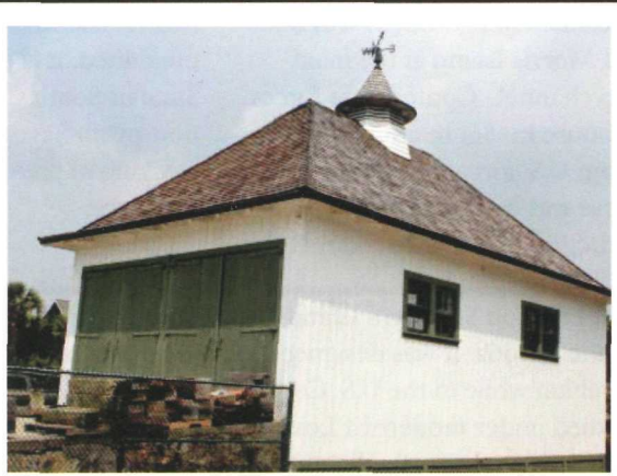
Former boathouse as present-day carpentry shop