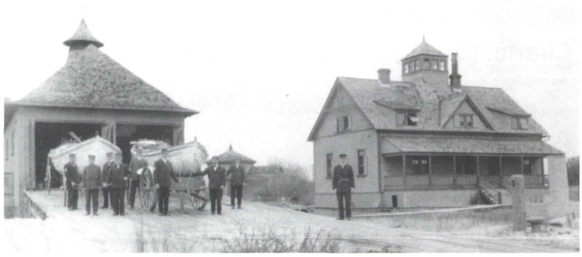
Sullivan's Island Life-Saving Station boathouse and quarters, c. 1895