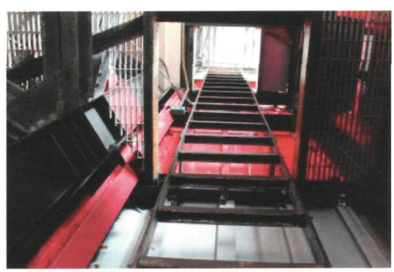
EXPERIENCE YOUR AMERICA™