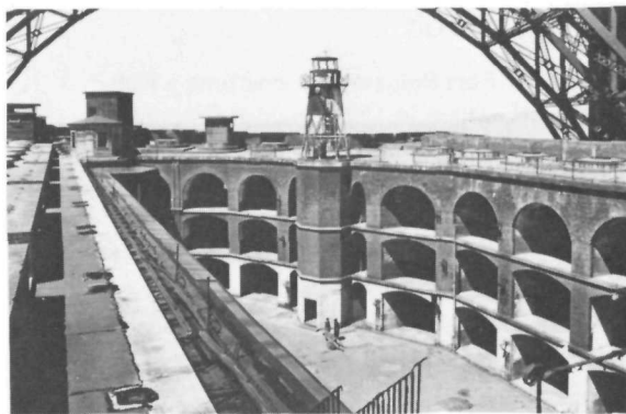
The handsome arched casemates with their intricate brickwork once housed the fort guns. There are thirty "gun rooms" on each floor.

The walls of the fort average 5 to 12 feet in thickness. Cisterns located under the southeastern rooms of the fort are filled by rainwater from the roof to provide a supply of water.