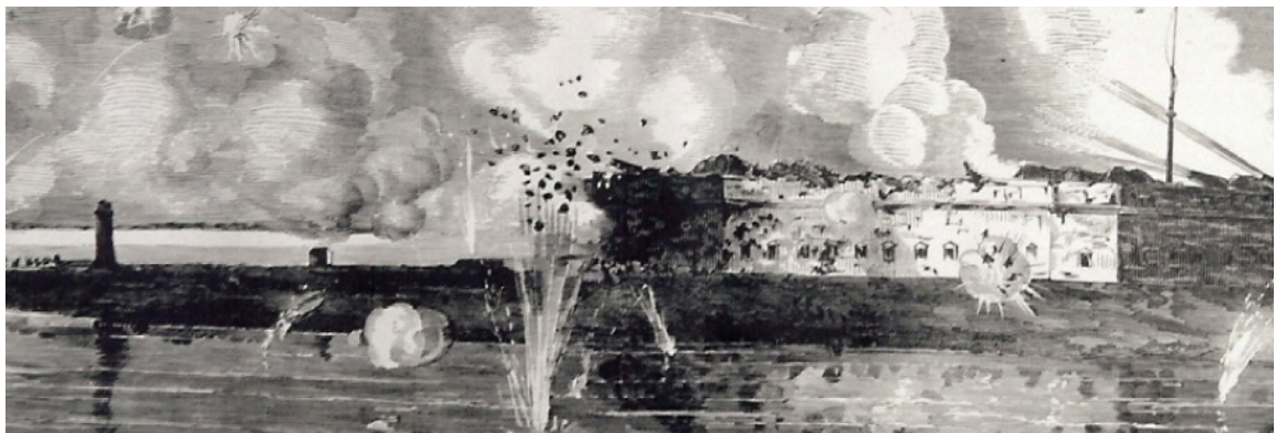
Despite being in direct line of fire during the bombardment of Fort Pulaski, the lighthouse survived due to the high angle of fire required for firing at long ranges. Thousands of projectiles passed over the lighthouse during the 30-hour bombardment. Leslie's Weekly, 1862.

witness to one of the most remarkable bombardments in American History. On April 10, 1862, Union forces in eleven batteries along the northern shore of Tybee Island opened fire on Fort Pulaski. The Union guns shelled the fort for thirty hours, with the Cockspur Island Lighthouse located precariously in the line of fire between the opposing forces. Despite its prominent location the tower suffered only minor damage during the battle.