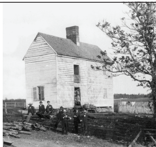
The Wilderness Tavern dependency building photographed in 1884

Cross over Lyons Lane (a private road—please do not walk along the road) to the trail climbing the hill in front of you. Stop by the chimney at the top of the hill. These remains are all that is left of a dependency building for Wilderness Tavern, which stood beneath modern Virginia Route 3.