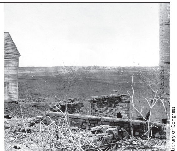
View of the open vista toward Ellwood Manor from the remains of Wilderness Tavern

War arrived on the threshold of Wilderness Tavern in May 1863, as Union troops marched east to Chancellorsville. Days later, this area became the Confederate rear after Thomas "Stonewall" Jackson's flank attack.