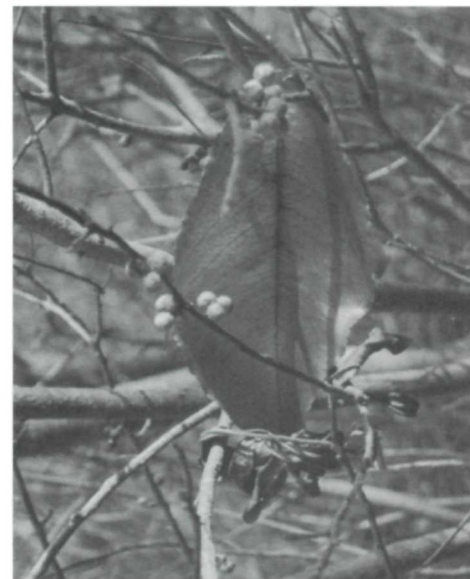
Autumn at Miller Field