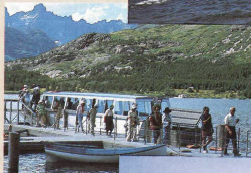
Passengers departing Chief Two Guns on Swiftcurrent Lake.

The Sinopah plies Two Medicine Lake, dwarfed by its namesake mountain at right, with Painted Tepee to the left.