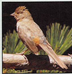
California Towhee Oak & scrub Fairly common year-round