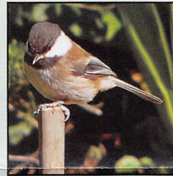
Chestnut-backed Chickadee Woodland Common year-round