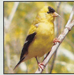
American Goldfinch Willow, scrub, grassland Fairly common year-round