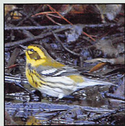
Townsend's Warbler Oak & Willow Fairly common fall–spring