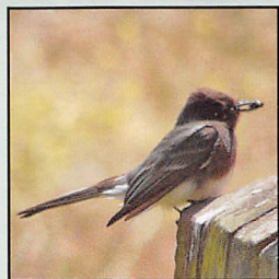
Black Phoebe All terrestrial habitats Common year-round