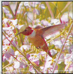
Allen's Hummingbird Woodland & scrub Common spring & summer