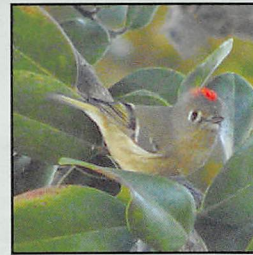
Ruby-crowned Kinglet Woodland Common fall & winter