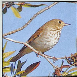
Hermit Thrush Oak & scrub Fairly common fall–spring