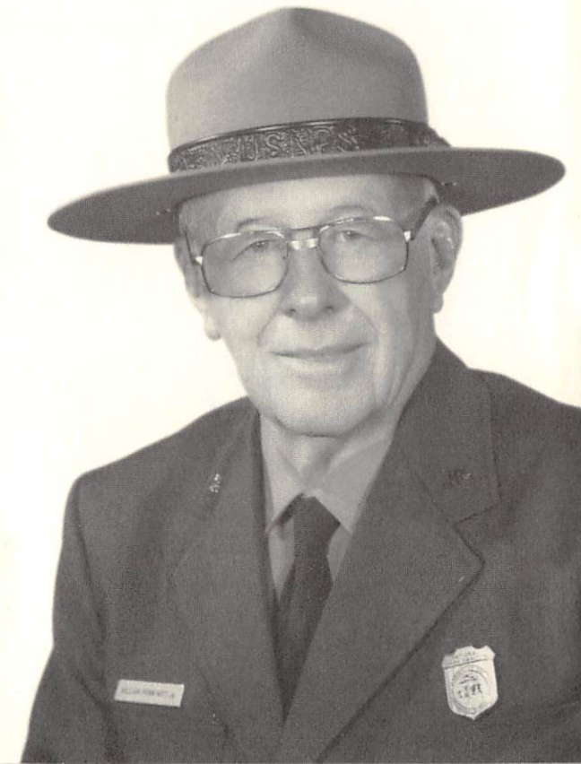
William Penn Mott, Jr. Director, National Park Service 1985-1989