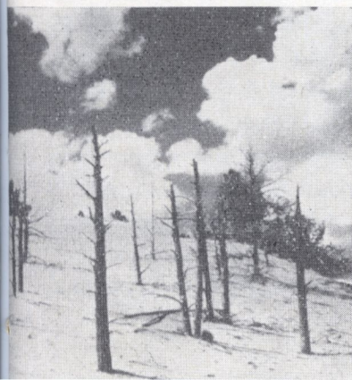
Stumps of pine trees emerge to along