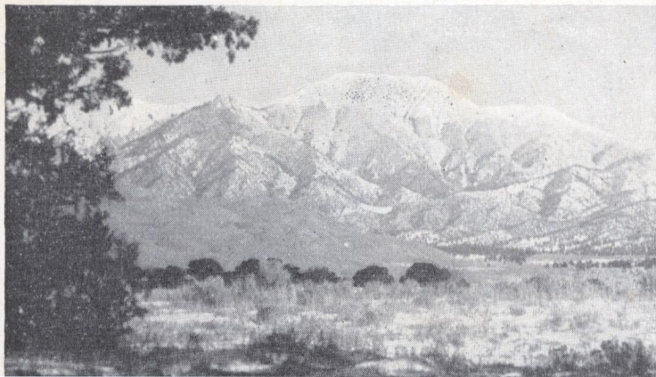
Herard Peak and the Sangre de Cristos in Winter