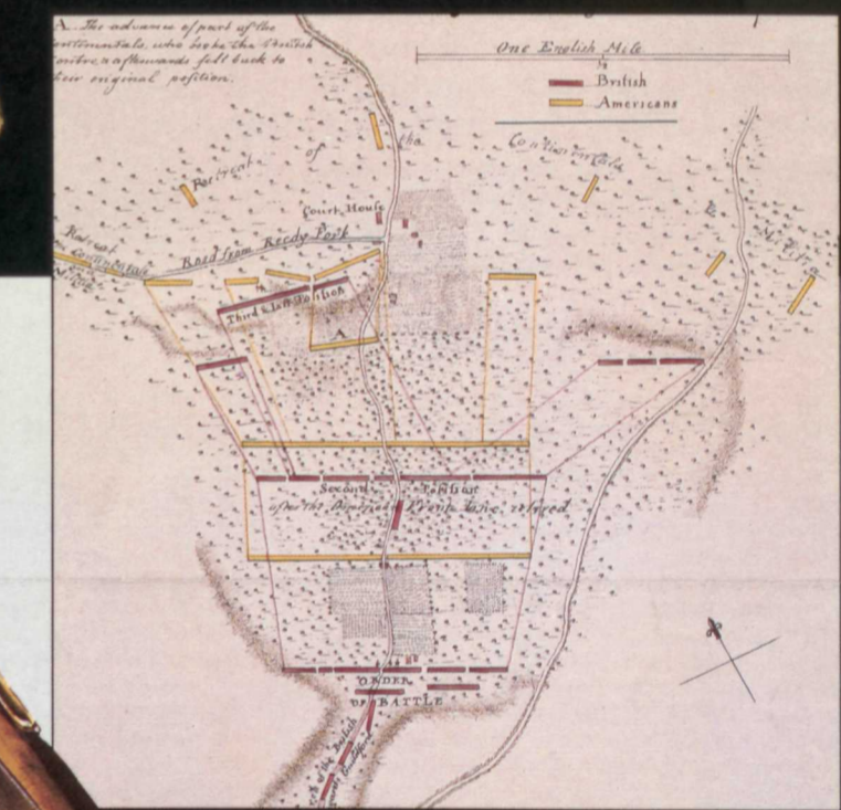
Banastre Tarleton, Cornwallis' dragoon commander, published this map of the battle in his 1787 memoirs. It clearly shows Greene's advantages of terrain and position. The American first line—held by militia—looked across cleared fields. Behind them 350 yards, in dense forest discouraging alike to cavalry and infantry formations, stood a second line of Virginia mil-

These two decisions—Greene's for South Carolina and Cornwallis's for Virginia—set the stage for the final collapse of British power in the South. For as Greene, using hard-hitting local partisans, brilliantly regained South Carolina in the ensuing months, Cornwallis, committed to an unsound operation, fought through a hapless summer that ended with his surrender at Yorktown, October 19, 1781—seven months after his "victory" at Guilford. Although the war technically dragged on until 1783, its outcome was settled when Nathanael Greene's great adversary in the Carolinas surrendered in Virginia.