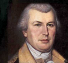
Nathanael Greene, a Rhode Island Quaker, proved himself an able, aggressive, and cunning soldier. He was robust and commanding in appearance, though he walked with a tiring limp, struggled against asthma, and suffered

from a recurrent eye infection got from a smallpox inoculation when a youth. He was 38 in the fall of 1780 when George Washington handpicked him for command in the South.