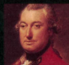
Cornwallis, short, heavyset, and also afflicted with a bad eye, was 42 this spring. Though sympathetic with American political thought, he loyally volunteered for service in America in 1775 and fought with distinction

from a recurrent eye infection got from a smallpox inoculation when a youth. He was 38 in the fall of 1780 when George Washington handpicked him for command in the South.