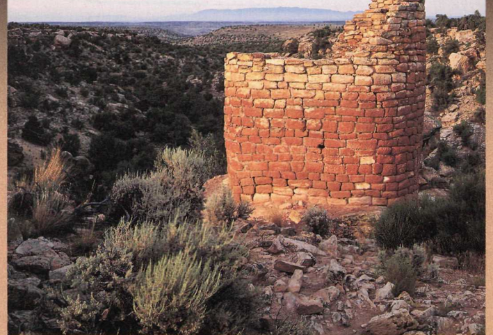
Hovenweep Castle (above), Horseshoe Tower, and the pictograph (center, right) help to tell the story of these ancient peoples.

The canyon and mesa country north of the San Juan River contains a number of archeological sites where the ancestors of today's Pueblo Indians once lived. Today round, square, and D-shaped towers at the heads of canyons are the most visible remains that mark the location of once-thriving communities. Though these structures have seen no human inhabitants in more than 700 years, they are still impressive. Since modern Americans have become acquainted with Hovenweep, all have wondered why these towers were built and what the communities were like that the inhabitants created. The archeological record provides many suggestions and tantalizing bits of information and are the basis on which today's theories are formed. Most dwellings have been constructed directly on the edge of a canyon, not a most practical location for safety and accessibility. Some structures have been positioned over isolated or irregular boulders. Many are associated with springs and seeps near the heads of the canyons. These positions suggest that the inhabitants were protecting something, if not themselves, then perhaps the water, always a valuable commodity in an agricultural society. Pollen studies show that much of the forest cover had been removed, indicating perhaps depleted resources and a growing population. Lack of resources may be one of the explanations for their inexplicable departure in the late 1200s.