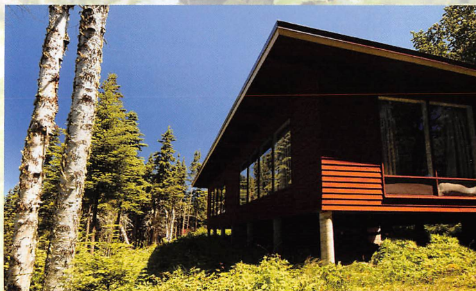
Housekeeping Cabin at Rock Harbor Lodge