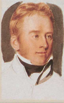
National Portrait Gallery, London

Maj. Gen. Sir Edward Pakenham, commander of the British army at Chalmette, was sitting for this portrait when he was summoned to command the Louisiana expedition. He was killed at New Orleans and the painting was never finished.