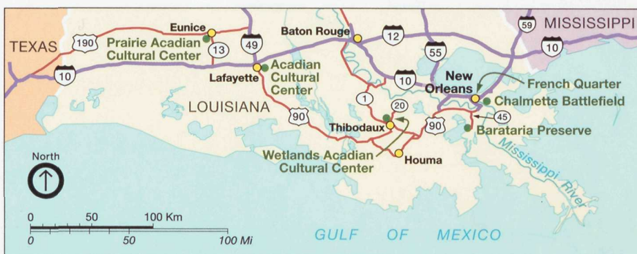
Chalmette Battlefield is one of six sites (shown in green) of Jean Lafitte National Historical Park and Preserve

however, and this, coupled with an inadequate ammunition supply, kept them from playing an important role in the battle.