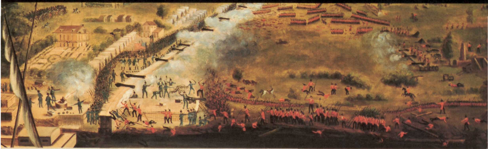
Battle of New Orleans , from the painting made in 1815 by Hyacinthe de Laclotte, an engineer in Jackson's army. New Orleans Museum of Art, gift of Col. and Mrs. Edgar Garbisch

National Park Service U.S. Department of the Interior