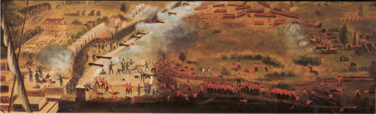
Battle of New Orleans , from the painting made in 1815 by Hyacinthe de Laclotte, an engineer in Jackson's army. New Orleans Museum of Art, gift of Col. and Mrs. Edgar Garbisch

National Park Service U.S. Department of the Interior