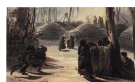
Top: Inside a Mandan earthlodge. Bottom: A Hidatsa winter village, by Karl Bodmer.