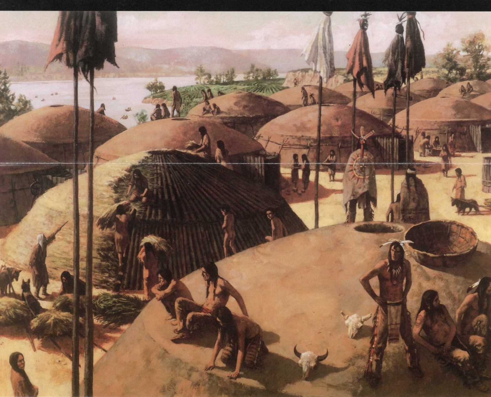
Mandan community before extensive contact with Europeans.