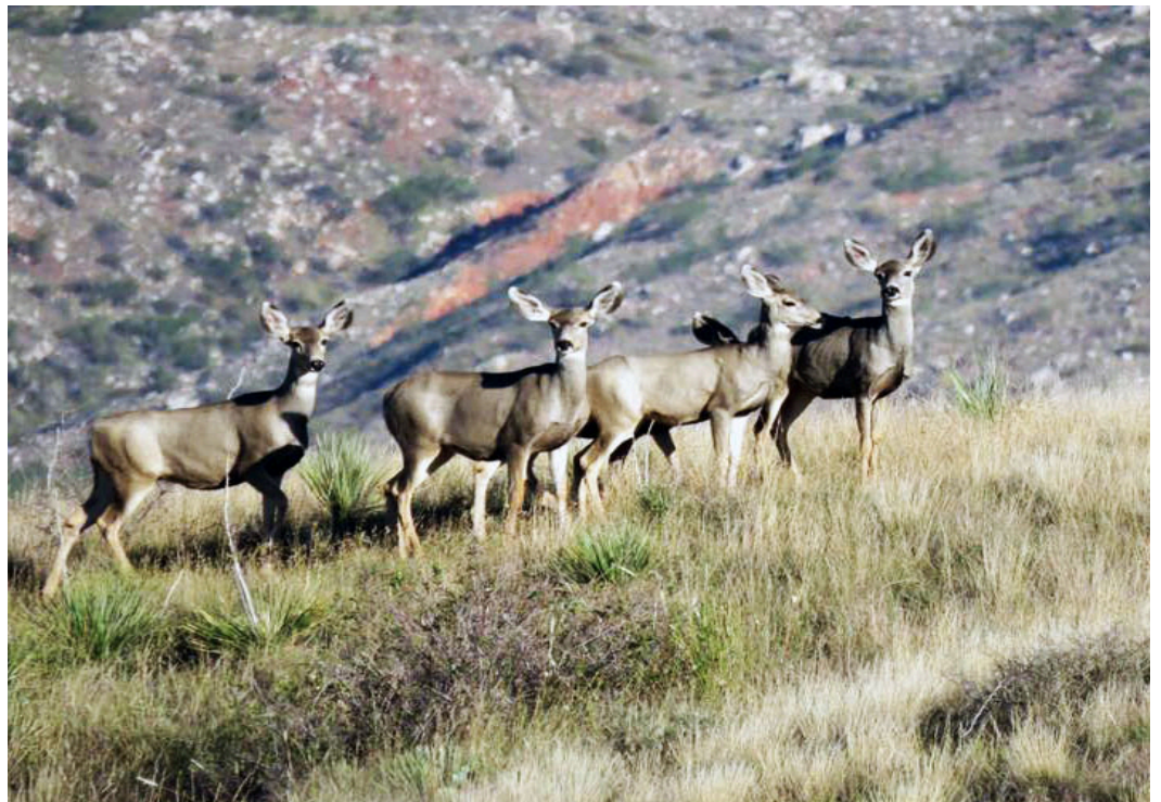
Have a safe hunting season!

To report hunting or game violations, contact a Park Ranger or Game Warden, or call (800) 792-GAME (4263) or 911.