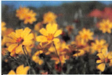
Wildflowers are abundant throughout the spring and summer.