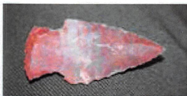
Arrowhead knapped from Alibates Flint.

Start your visit with a morning walk to the Alibates Quarries. Hear the tale of a stone that was so useful and valuable that it was used by indigenous people for thousands of years.