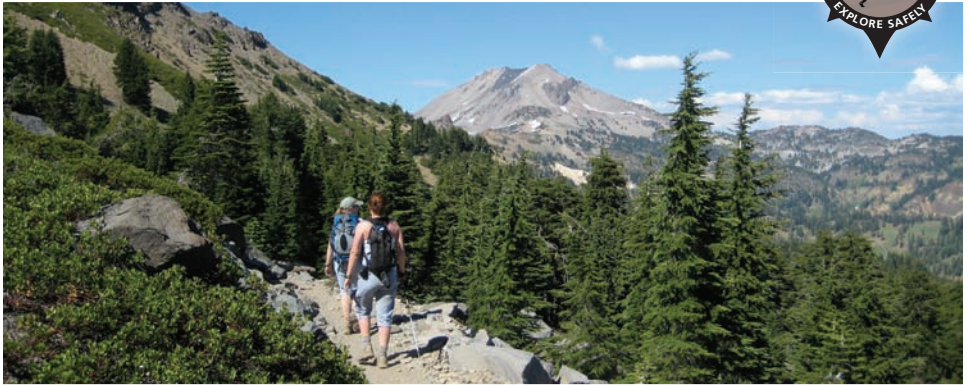
Hikers enjoys views of Lassen Peak on the descent from Brokeoff Mountain summit