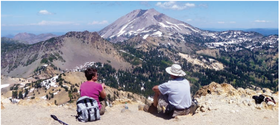
Hikers enjoy the spectacular panoramic view from Brokeoff Mountain summit

Closest emergency phone is at the Kohm Yah-mah-nee Visitor Center.