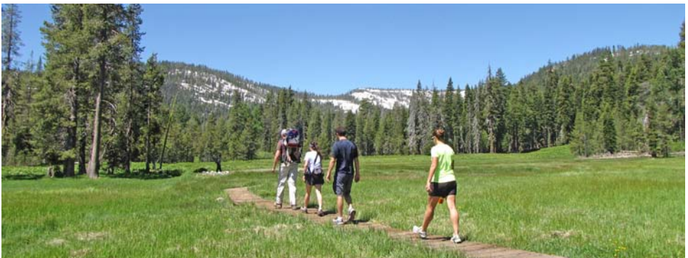
Hikers pass through upper Drakesbad Meadow

Black bears have been sighted frequently in the Warner Valley area. Avoid potential bear encounters on the trail by making noise to make your presence known. Be particularly careful near streams, and when vegetation or terrain limits visibility. If you encounter a bear, do not run. Slowly back away or detour around the bear if it is not aware of you. Report any bear encounters to a park ranger.