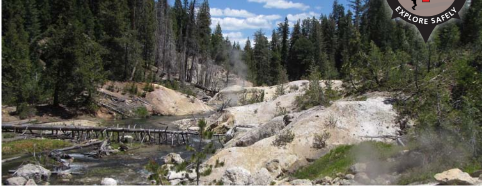
Steam rises over Hot Springs Creek