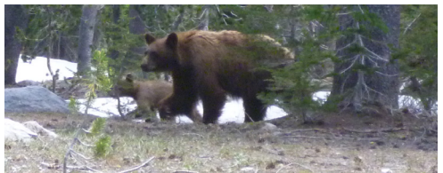
Black bears are occasionally spotted in the Kings Creek area