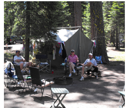
Campers at Crags campground