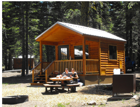
Manzanita Lake camping cabin