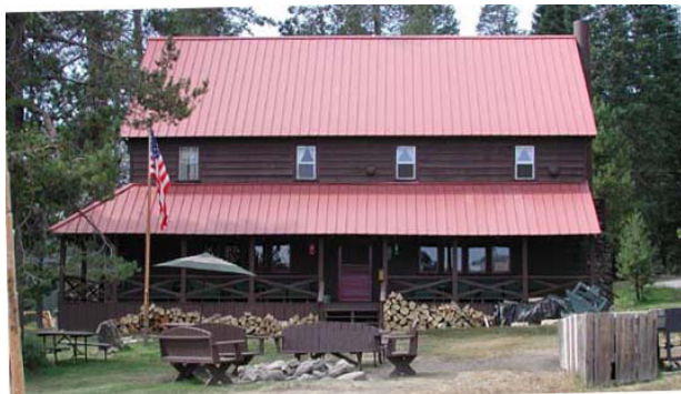
Drakesbad Guest Ranch Lodge