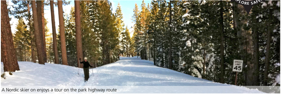
A Nordic skier on enjoys a tour on the park highway route

Winter snowfall transforms Lassen Volcanic National Park into a vast playground for Nordic skiers and snowshoers. On the north side of the park, gentle terrain through dense pine forest offers excellent beginner and intermediate touring routes. Begin your winter adventure at the Loomis Plaza parking area.