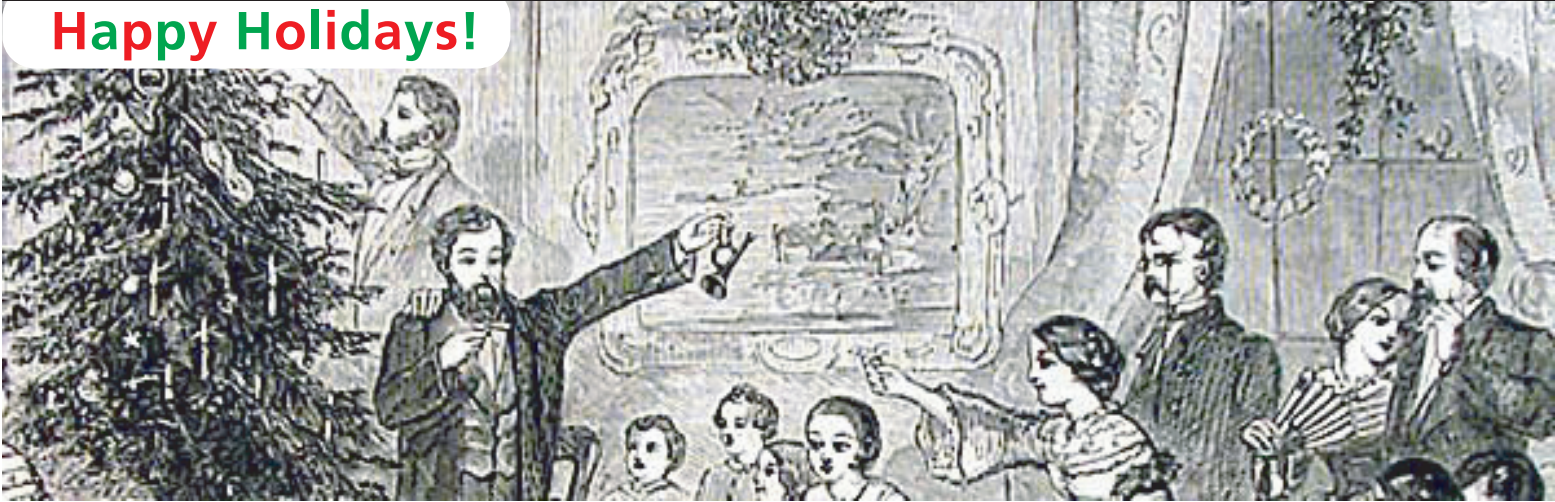
The Christmas Tree - Winslow Homer 1858

Today it would be difficult for the average American to overlook the Christmas holiday, with displays at most retail stores, Christmas specials on television, and lights illuminating neighborhoods around the country. How was Christmas celebrated in the 1800s? How did the Lincoln family celebrate the holiday?