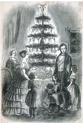
Godey's Lady's Book - 1850

The Christmas tree was first represented in popular print in a woman's magazine, Godey's Lady's Book , in 1850. The image was an Americanized version of a very popular image of Queen Victoria and her family from the Illustrated London News . America's fondness for Queen Victoria helped popularize the idea of having a Christmas tree inside the home. While we have no evidence that the Lincolns had a Christmas tree, the family may have visited the Christmas tree exhibited at the First Presbyterian Church located a few blocks away.