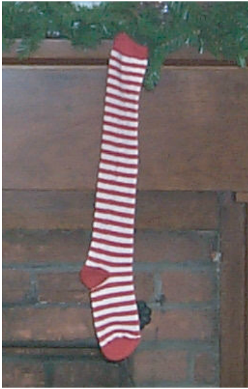
Lincoln Home Stocking