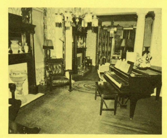
The Music Room

poured concrete. Interior floors are hardwood downstairs and solid pine upstairs. The house is estimated to have been constructed in the early 1880's. There is limited landscaping to the property which covers the entire 33' × 136' lot with the exception of the 3-foot wide side alley. The alley is located on the east side of the residence and leads from the street to the carriage house.