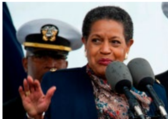
The public faces of the 1960s Civil Rights Movement were often men, with women usually occupying roles behind the scenes. The Evers maintained such a partnership until Medgar’s assassination thrust