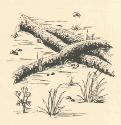
ESKER IN THE MEADOW

Look along the trail for long low mounds of earth. These winding mounds were made by pocket gophers pushing earth into the snow during the winter. The dirt-filled tunnels remain after the snow melts, lasting until rain washes them away. This, together with the activities of other burrowing animals, helps to mix the organic material into the soil.