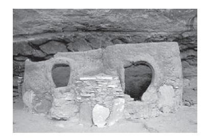
Horsecollar Ruin earns its name from the shape of the doors to these granaries.