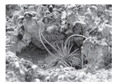
Cryptobiotic soil crust

Natural Bridges preserves habitat for a variety of plants and animals. Visitors may see mule deer browsing, hear the falling notes of a canyon wren, or smell the sweet aroma of spring wildflowers. To guard these experiences for future generations, please observe the following regulations: