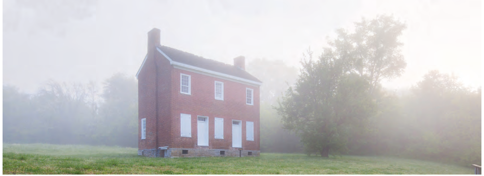
The Gordon House was home to a family living along the Natchez Trace in the early 1800s.