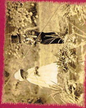
Costumed children at play circa 1912 during one of numerous lawn parties held for the neighborhood's predominately immigrant families.

Proceeds from admission fees and purchases made at this historic site benefit social services at The House of the Seven Gables Settlement. Founded in 1908, the Settlement continues to provide educational and social activities for children and senior citizens